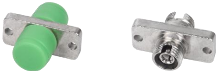
FC Fiber Optic Adaptor (Rectangular)