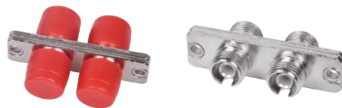
FC Fiber Optic Adaptor (Duplex)