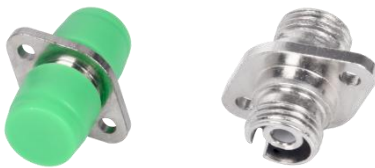
FC Fiber Optic Adaptor (Oval)