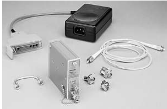
ORR24 with standard accessories and optional power supply.

Note: Allowable deviation from the nominal attenuation in the table is very tightly specified in the SDH/SONET recommendations. The actual allowable deviation values depend on f/f_r and the bit rate. These values run as low as \pm 0.5 dB.